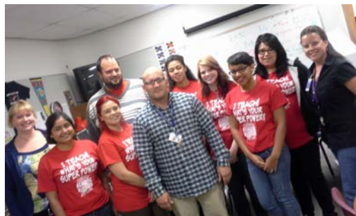
Pictured: College Interns from Glendale Community College and Northern Arizona University on the scene at Lakeview Elementary

The Washington Elementary School District (WESD) Academic Support Programs Department worked together with Glendale Community College, Grand Canyon University and Northern Arizona University to forge a new partnership to provide academic intervention for elementary students in eight schools within the district. The college/university students would use these placement hours to meet the requirements for education classes. WESD and the local colleges/universities worked together on a new plan that included organizing schedules, reviewing requirements for placement hours, new job descriptions, background checks, planning and hosting orientation and securing funds for T-shirts and backpacks for the college students.