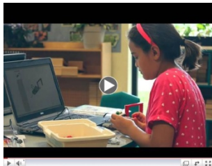
Click2Science: Moments that Click!

Check out the following video to learn more!